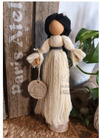
Soft Life™ Series

Honouring the bonds that weave generations together, carrying stories of care, continuity, and belonging. A series that reflects continuity and collective story-making