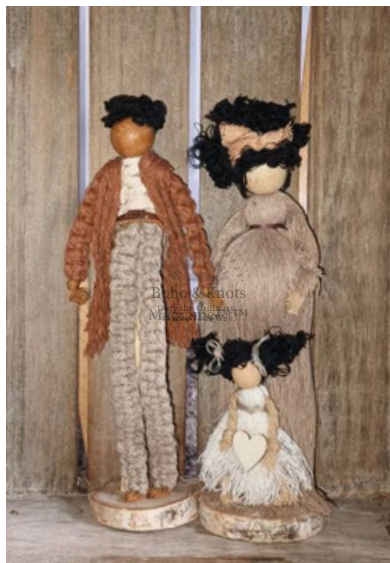
Family Threads™ Series

This series embodies creative freedom, artistic exploration, and blossoming. She carries stories of poetry, music, and textures of authentic expression.