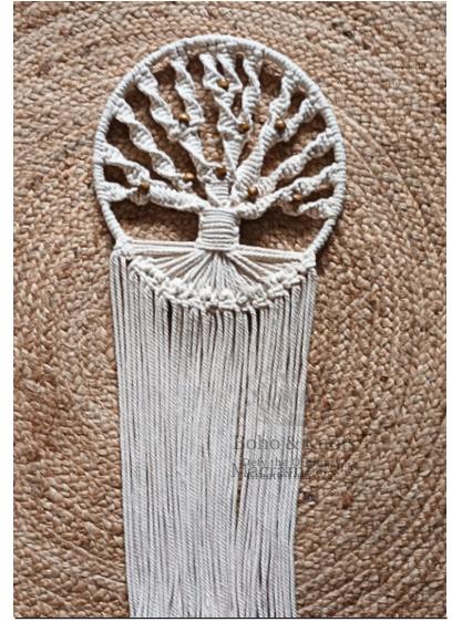
Tree of Life & Legacy™.

A tactile wall hanging that unfolds identity, memory, and meaning through detailed and layered artistry.