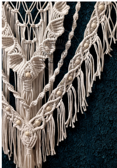
Layers of Becoming™.

Feathers, beads, and textures form a ceremonial dreamcatcher inspired textile, embodying cycles of life.