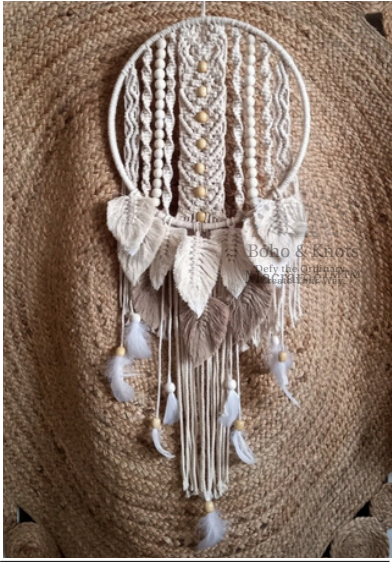
Seasons, Dreams, & Lineage™.

Feathers, beads, and textures form a ceremonial dreamcatcher inspired textile, embodying cycles of life.